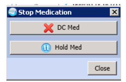
Figure 3: Second dialog when MSCE HOLD HOME MED is set to YES